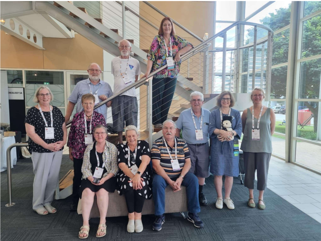
South Australians at the Event.