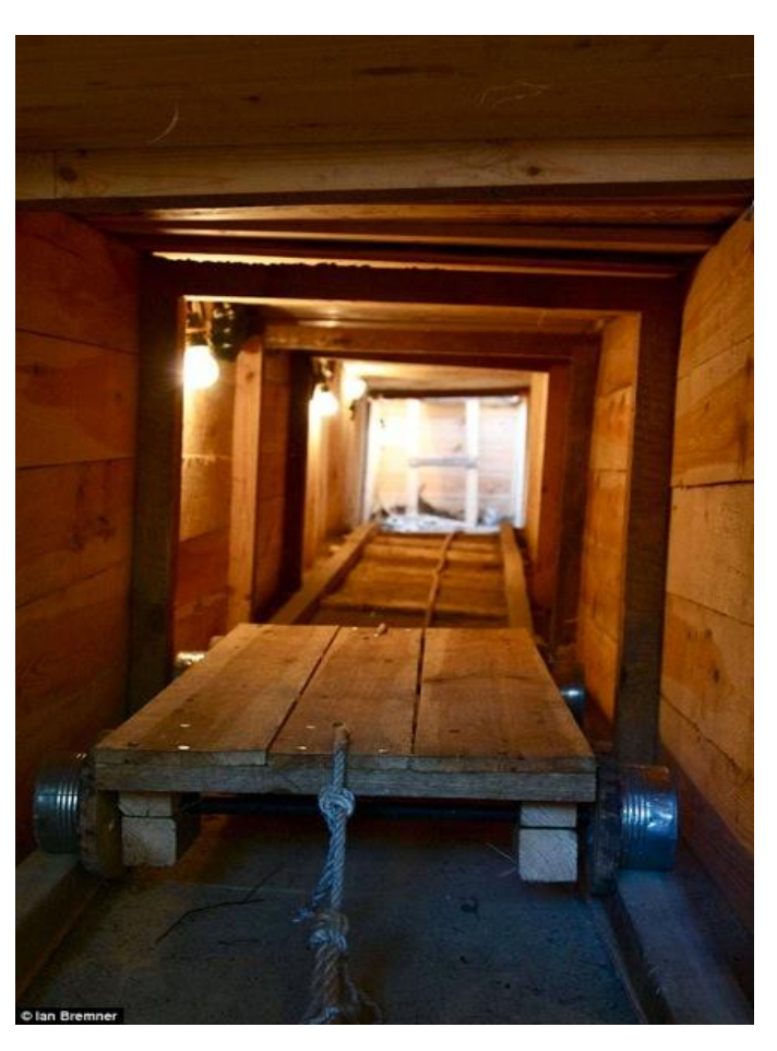
Tunnel vision: A tunnel reconstruction showing the trolley system.

Barely a third of the 200 prisoners - many in fake German uniforms and civilian outfits and carrying false identity papers - who were meant to slip away managed to leave before the alarm was raised when escapee number 77 was spotted.